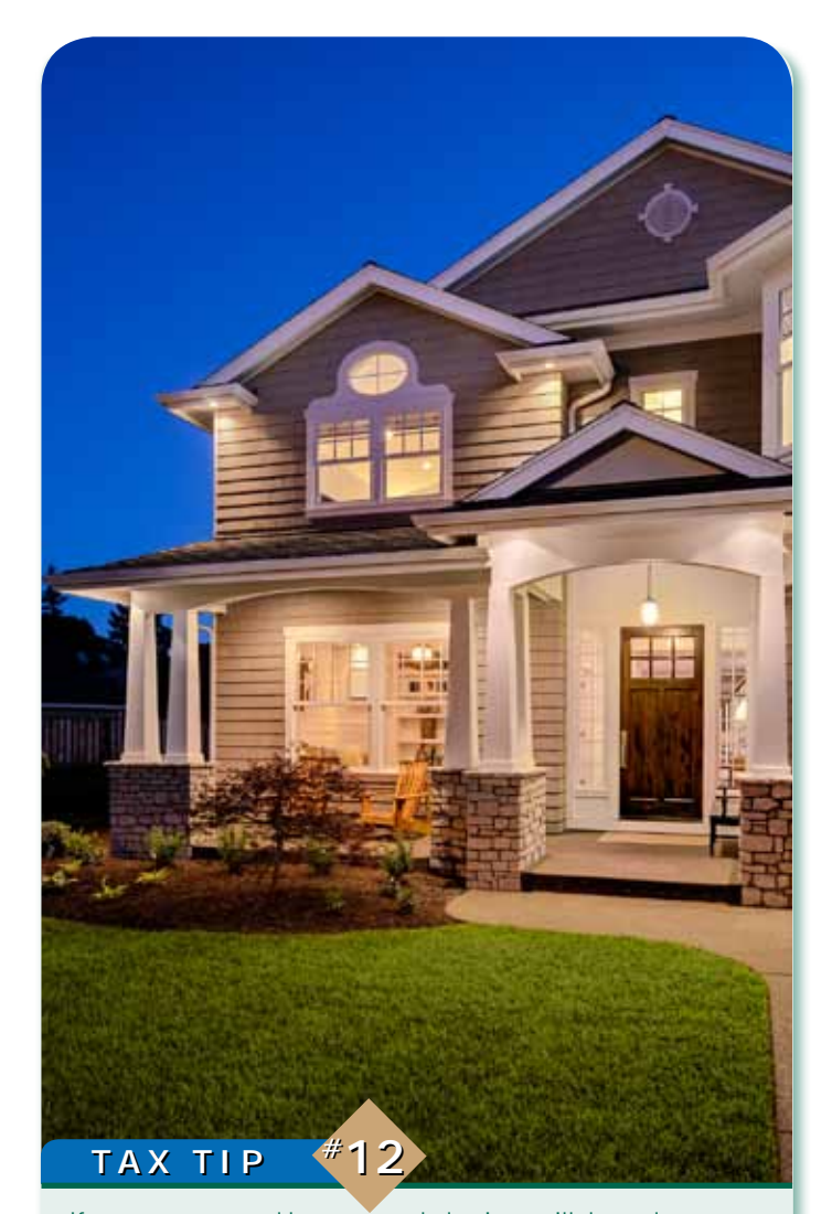
If you own a second home, your deductions will depend on whether you use the vacation home solely for enjoyment or combine business and pleasure by renting the property part time. We can help you determine what expenses are deductible, according to your unique circumstances.

If you rent the home for more than 14 days per year and it qualifies as a personal residence, you can also deduct the appropriate portion of upkeep, insurance, utilities, and similar costs to offset rental income. The property may be depreciated, which can help reduce your rental income without expending cash. As long as you use the place yourself for less than 14 days or 10% of the rental days, it is considered rental property, and you can claim a rental loss (subject to certain limitations).